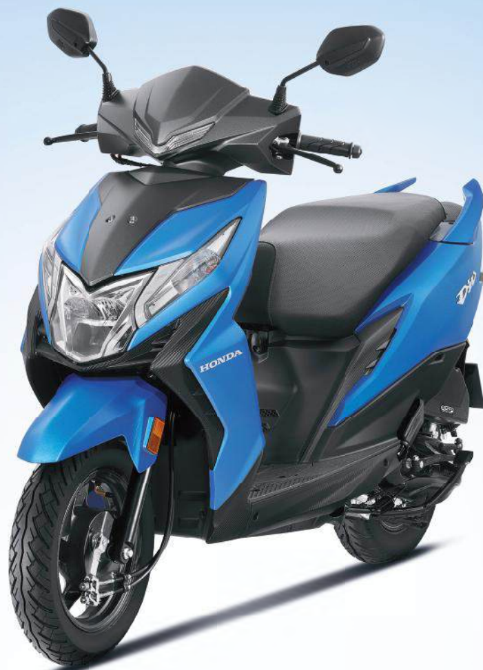
MAT MARVEL BLUE