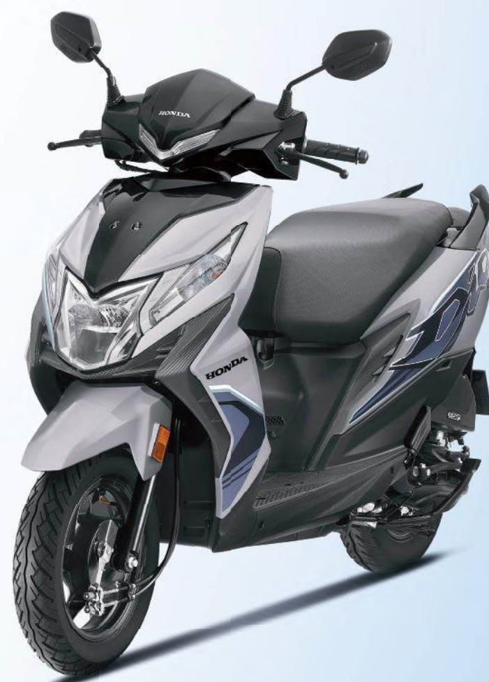
PEARL IGNEOUS BLACK + PEARL DEEP GROUND GRAY